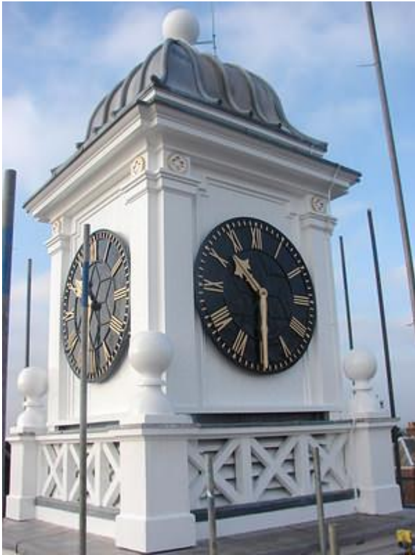
Detail of the Tower