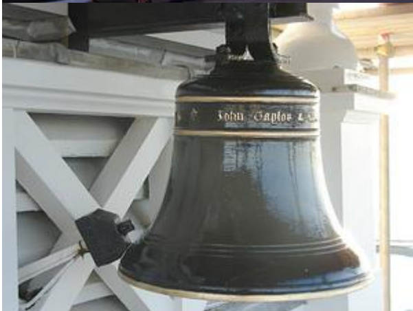
School Bell - newly painted