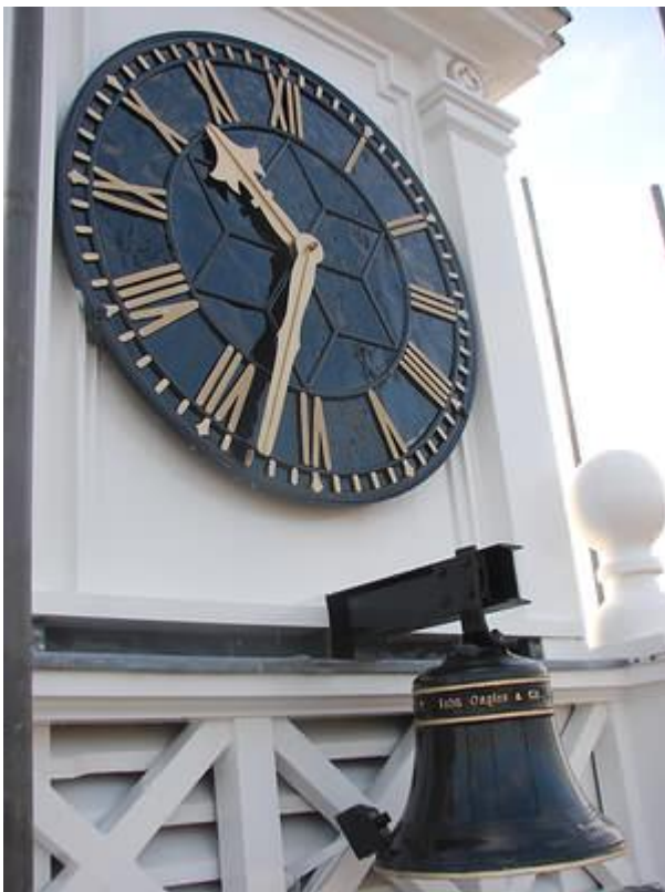
Scene from the top

The last maintenance to the clock face seems to have been done in the summer of 1981.